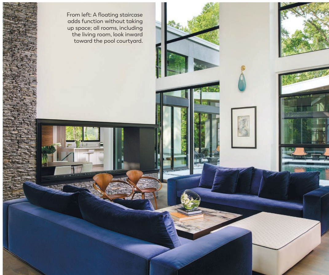
From left: A floating staircase adds function without taking up space; all rooms, including the living room, look inward toward the pool courtyard.

Known for a range of clients including Bartaco, Cruz & Associates and Delia's Chicken Sausage Stand, Plexus R+D captures attention on an international stage. But working on projects right here at home—one of which is a private residence created for a couple they met during—what else—the Design is Human Atlanta modern architecture tour put on by MA!—gives the team just as much pleasure.