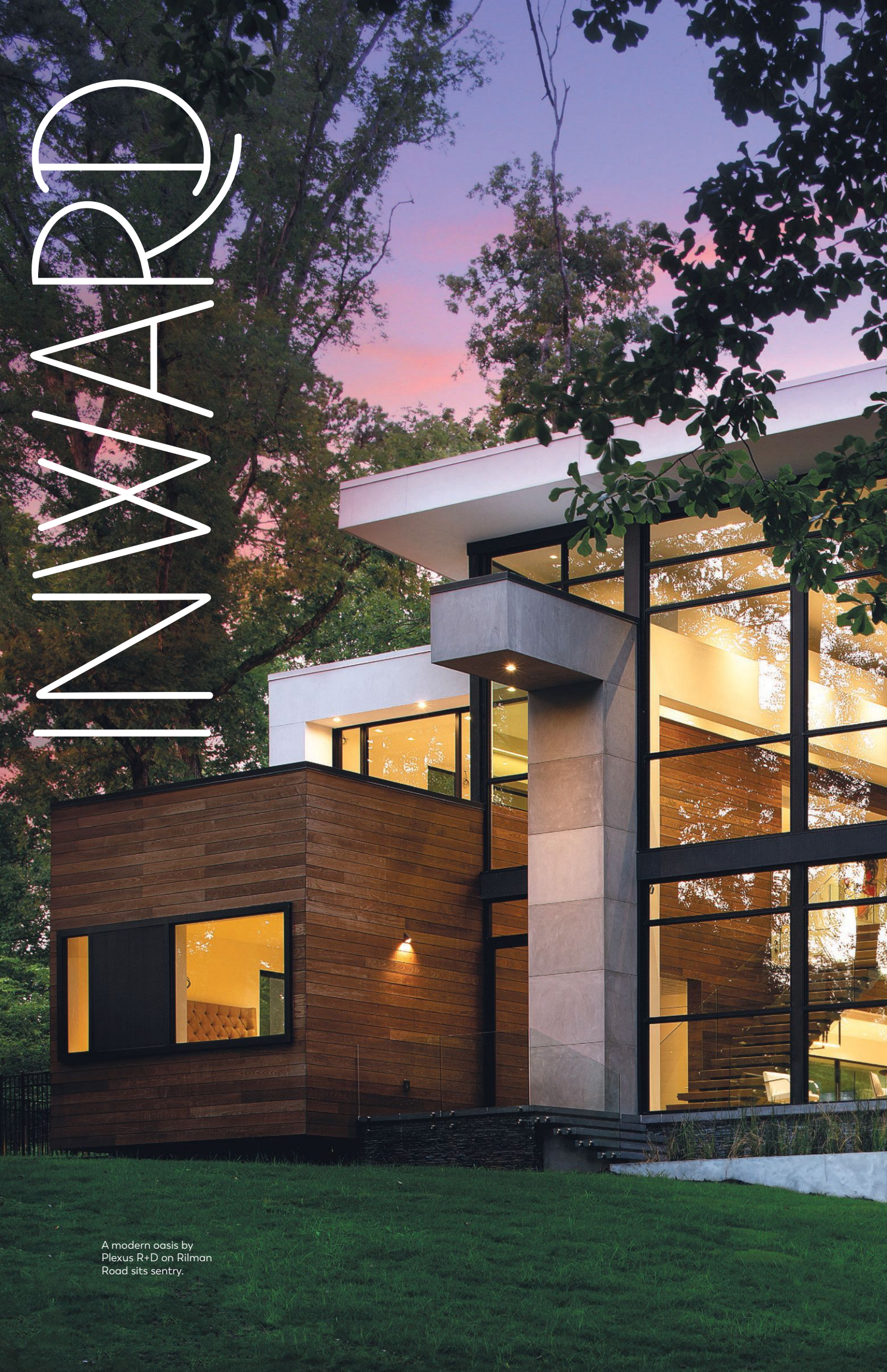
A modern oasis by Plexus R+D on Rilman Road sits sentry.